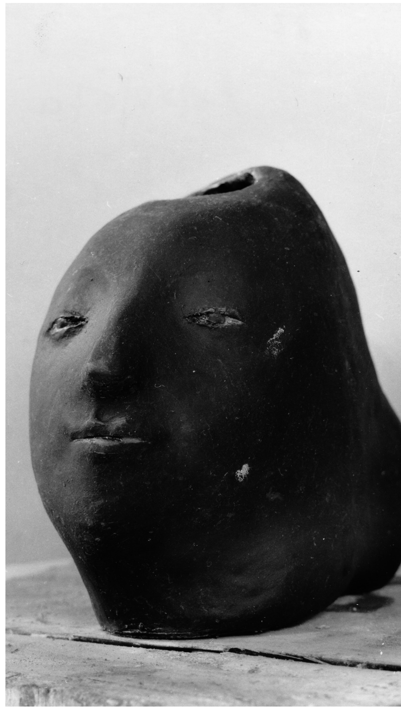
Dot Gain 10%