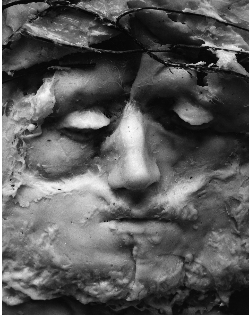
Dot Gain 10%