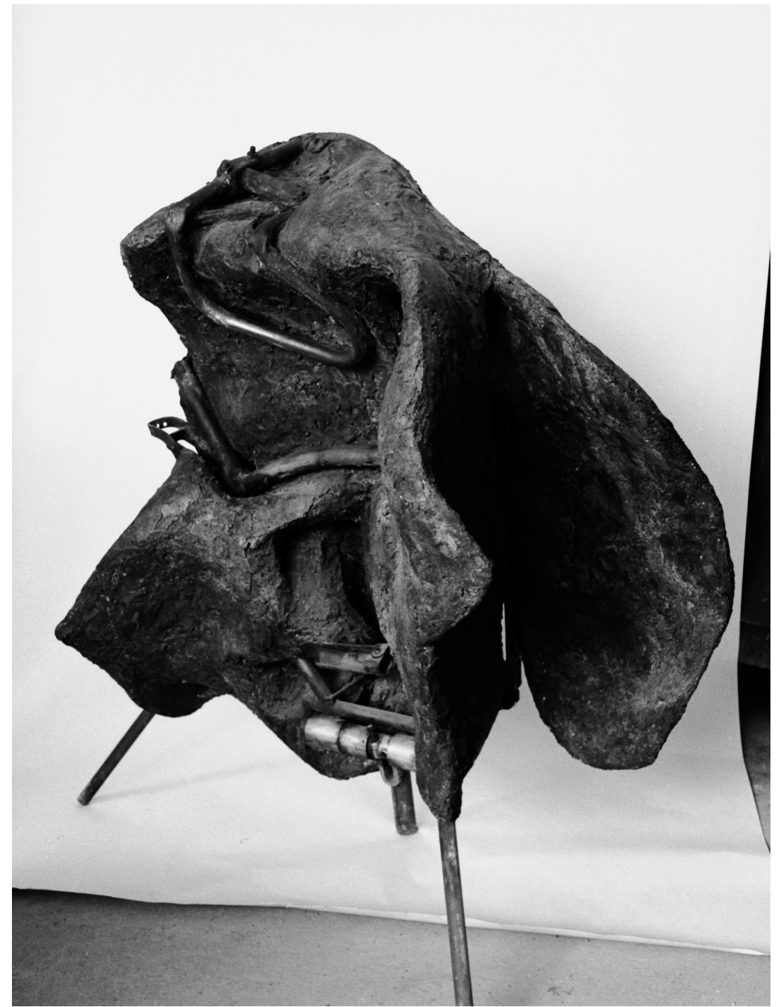
Dot Gain 10%