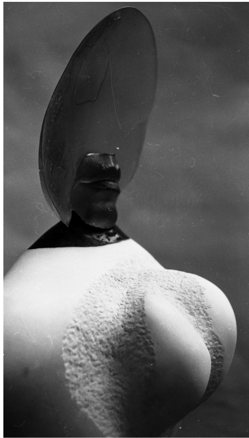
Dot Gain 10%